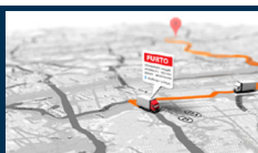
Maps and tracking