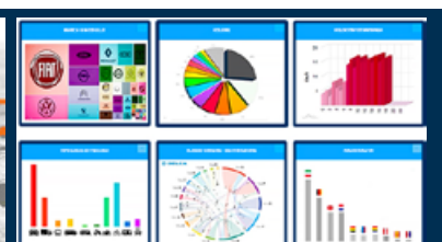
Analysis and statistics